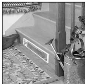
Whispa Fan Convector