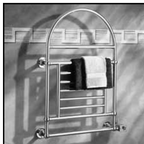
Electric Model EB29 Towel Warmer

MYSON offers a full range of heating products. Shown below is one from each of the different product lines.