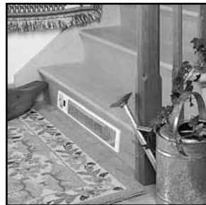
Whispa Fan Convector