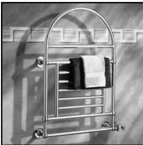
Electric Model EB29 Towel Warmer

MYSON offers a full range of heating products. Shown below is one from each of the different product lines.