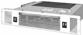
Whispa E50 Electric