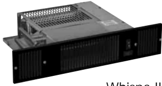
Whispa III 5000 Whispa III 7000 Whispa III 9000