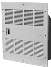
Whispa III 5000 Wall Mount