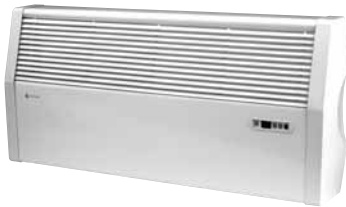
Lo-Line RC HC