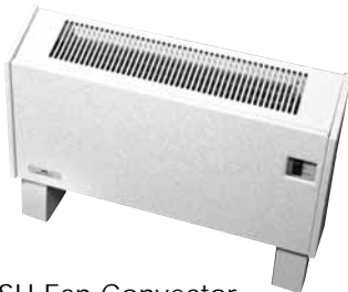
CSU Fan Convactor Floor Mount