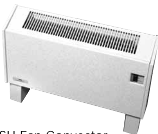
CSU Fan Convactor Floor Mount