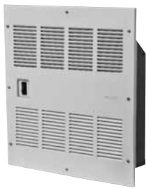
Whispa III 5000 Wall Mount