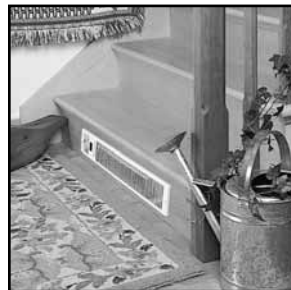
Whispa Fan Convector