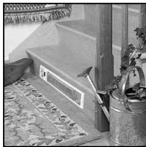
Whispa Fan Convector